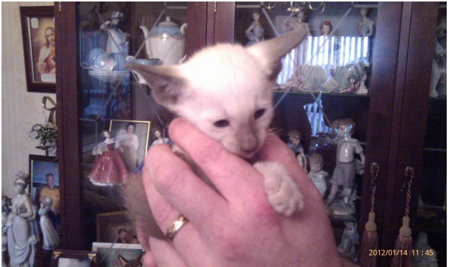
7 weeks old