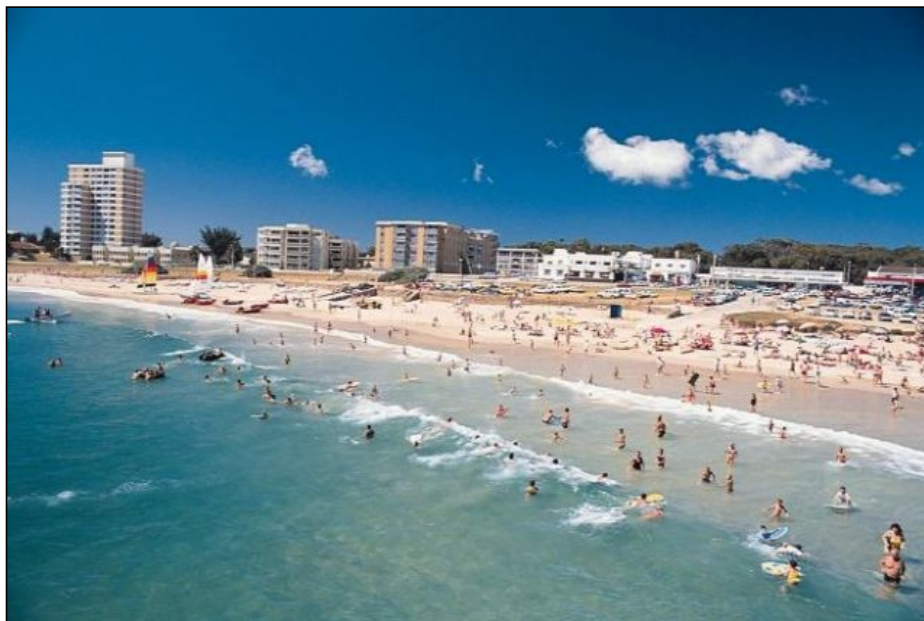
Port Elizabeth Beach