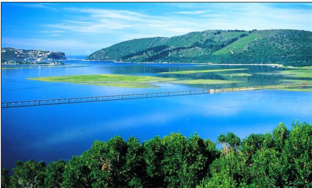
Random Image from "web" quote